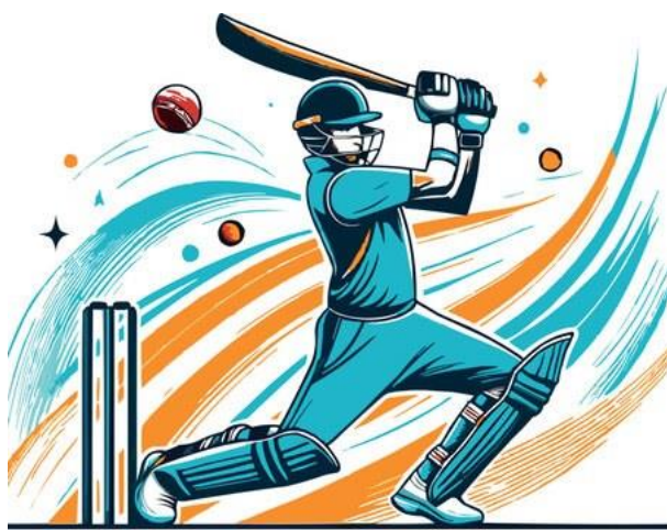
1 - Cricket trip Year 5 & 6 - Monday 7th July 2025