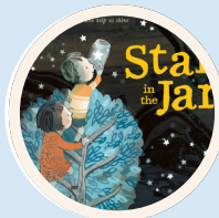
Star In The Jar