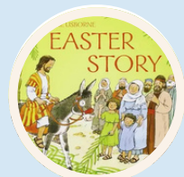
The Easter Story