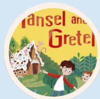
Hansel & Gretel