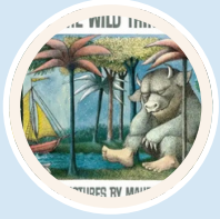
Where The Wild Things Are