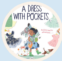
A Dress With Pockets