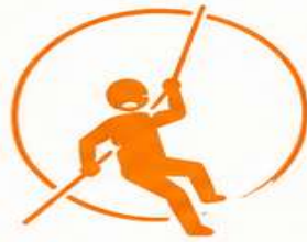
Abseil & Zip Wire