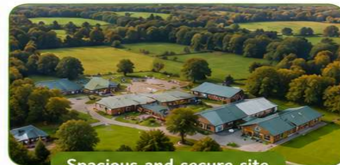
Spacious and secure site